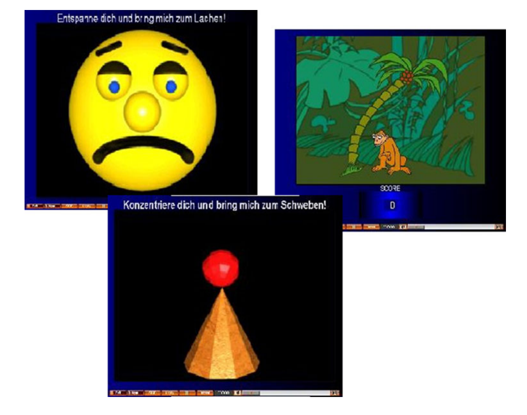
Fig. 1 Screenshots from the different games for Neurofeedback and EMG Biofeedback: smiley, monkey and ball

In the first 2 min of each session (first trial of the smiley game), the baseline was determined, by measuring the theta/beta ratio (NF) or the EMG amplitude (BF). During the games, subjects received both positive auditory and